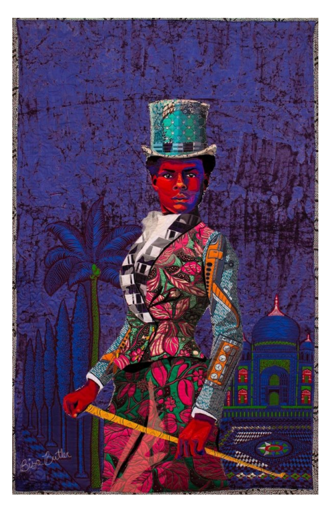
Bisa Butler, The Equestrian , 2019. Cotton, wool and silk, quilted and appliquéd. 68 x 43 in.