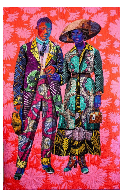
Bisa Butler, Broom Jumpers , 2019. Cotton, silk, wool, and velvet. 98 x 58 in. (Mount Holyoke College Art Museum South Hadley, Massachusetts)