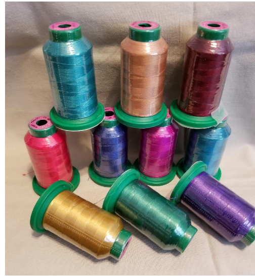
B. Ten(10) spools of Jewel tone 100% Polyester Isocord 40 thread. New in original wrapper. $50.00