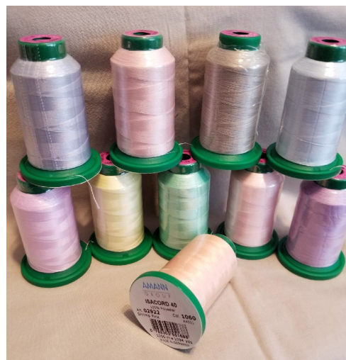
F. Ten (10) spools of Pastel tone 100% Polyester Isocord 40 thread. New in original wrapper. $50.00