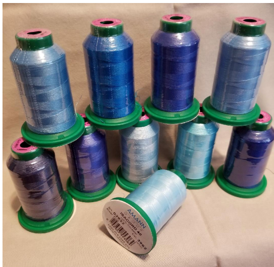
C. Ten (10) spools of Blue/Purple tone 100% Polyester Isocord 40 thread. New in original wrapper. $50.00