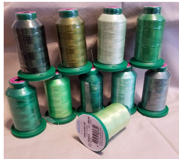
D. Ten (10) spools of Green tone 100% Polyester Isocord 40 thread. New in original wrapper. $50.00