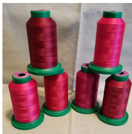
H. Six (6) spools of Red/Wine tone 100% Polyester Isocord 40 thread. New; not in original wrappers. $25.00