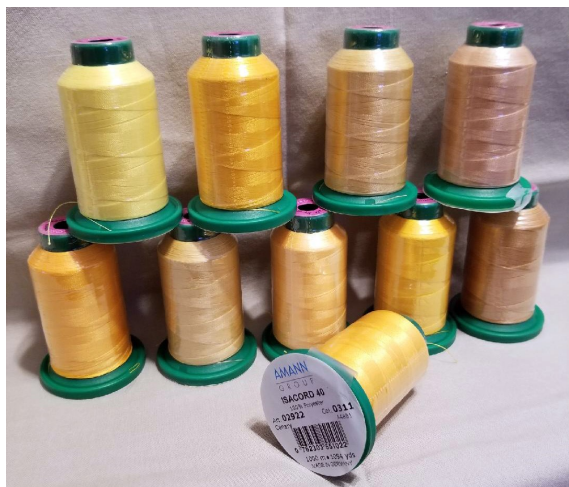
E. Ten (10) spools of Yellow/Gold tone 100% Polyester Isocord 40 thread. New in original wrapper. $50.00