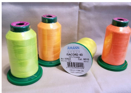
G. Four (4) spools of fluorescent 100% Polyester Isocord 40 thread. New in original wrapper. $20.00