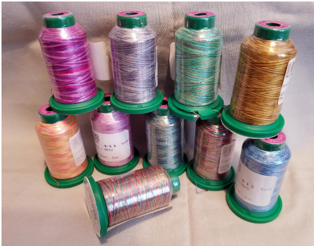
A. Ten(10) spools of variegated 100% Polyester Isocord 40 thread. New in original wrapper. $60.00

Please call Nancy Jo Michaud 651-806-5385 (home) or 704-608-4669 (cell) for information. Additional colors and sets of spools are available. Thread spools can be delivered at the December guild meeting.