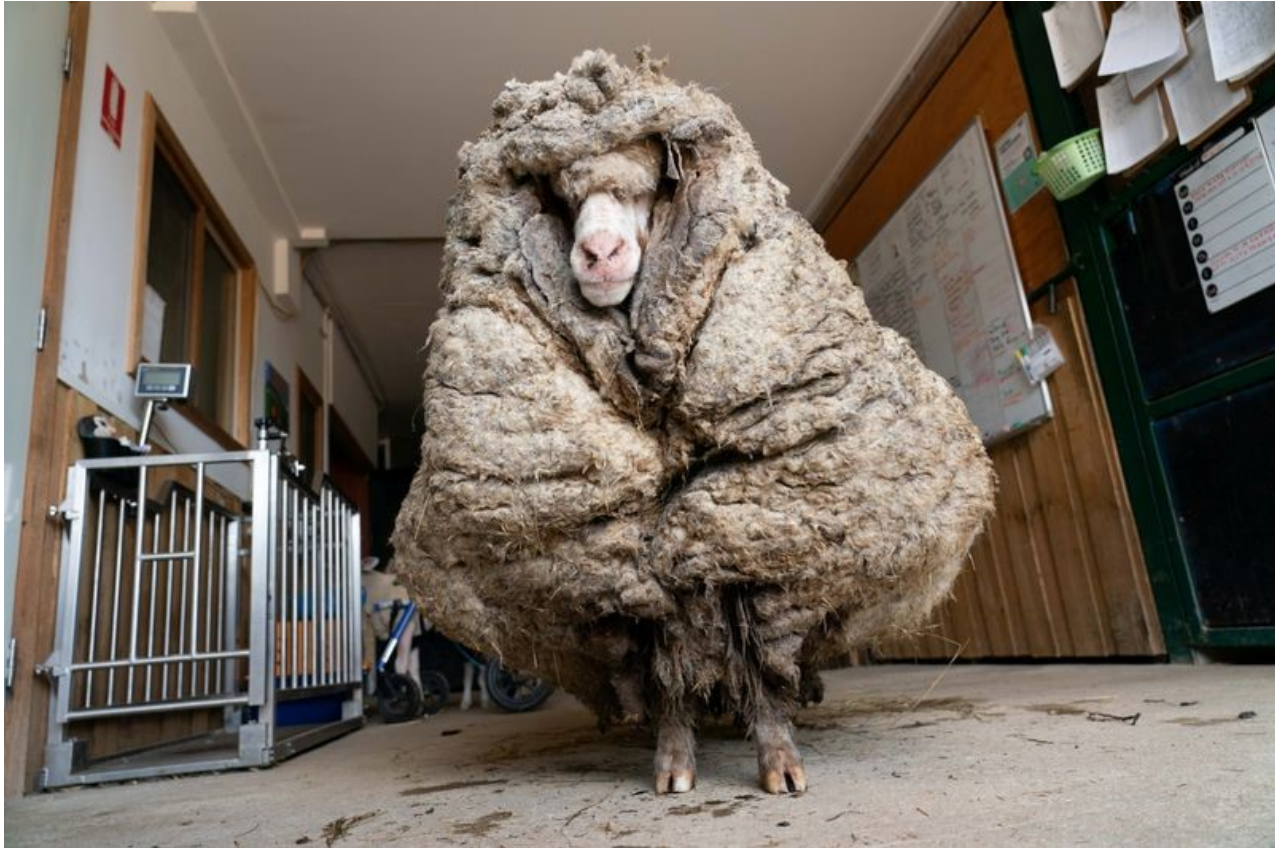
Sheep Baarack is seen before his thick wool was shorn in Lancefield, Australia