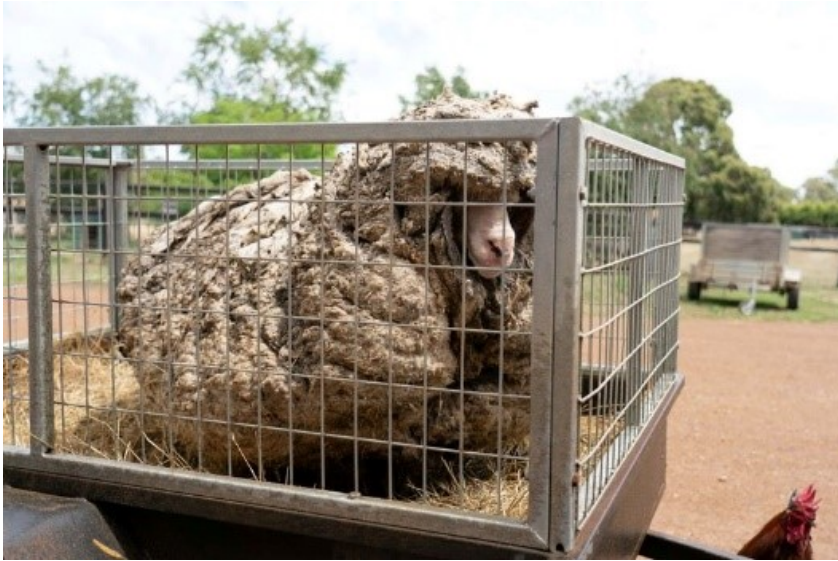
Sheep Baarack is seen before his thick wool was shorn in Lancefield, Australia