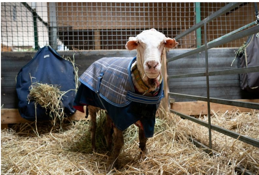
Sheep Baarack is pictured after his thick wool was shorn in Lancefield, Australia