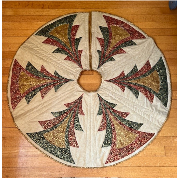
The first is a Christmas panel. The Christmas tree skirt was a pattern called Luminous, designed by Jenice Belling of Quilted Garden Designs.