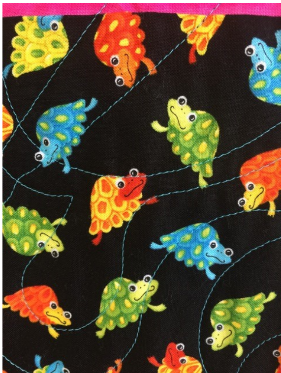
"Happy Turtles" and is about 50" wide by 59" long. It's professionally quilted with a turtle motif.