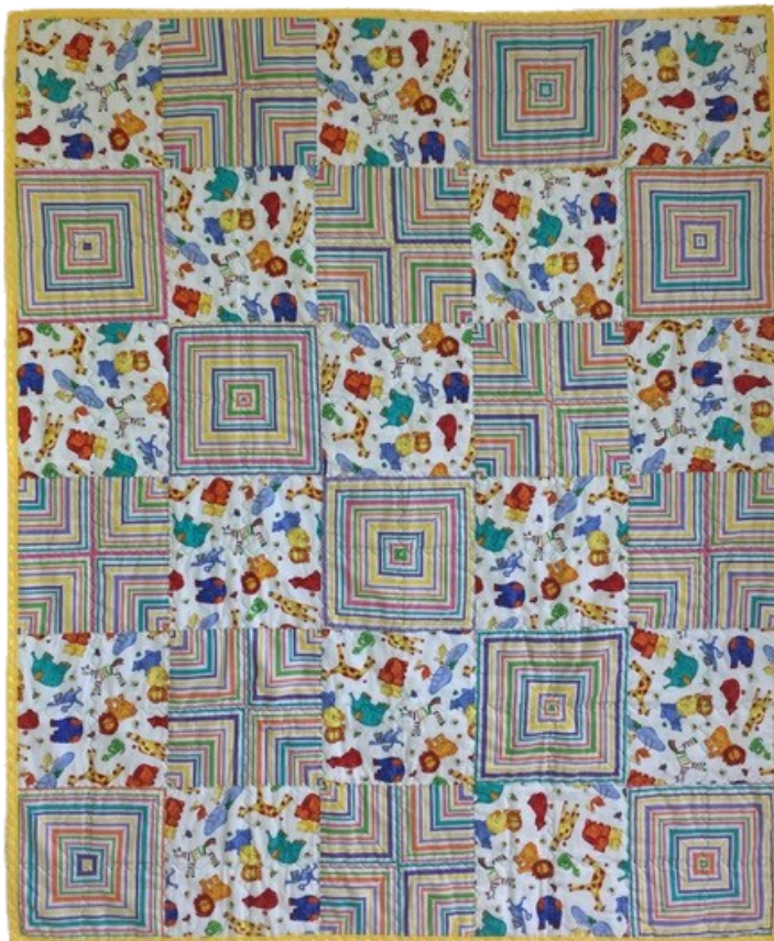
"A Day at the Zoo" and is 41" wide x 49" long.