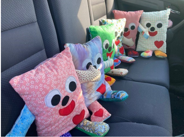
Pillow pals from Barbara Barron (GCQG) back seat driving to Delray with Maureen. These pillow pals were such a cute addition to our comfort quilts!