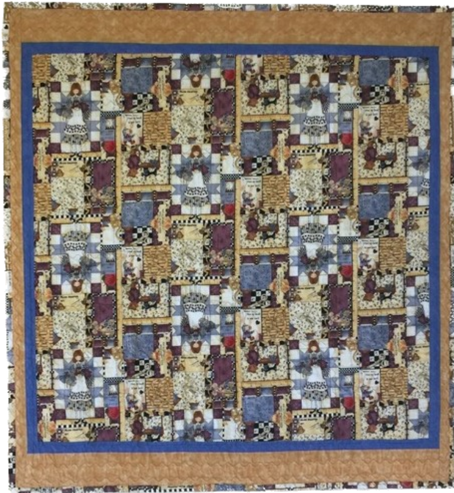
"Little Miss Sewist" and is about 41" wide by 44" long.