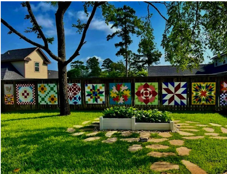
Someone hung their painted barn quilts on their privacy fence. Posted on Facebook by Knot Enuff Quilts and Antiques, LLC.