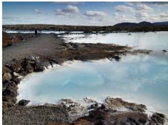
The Blue Lagoon, Iceland