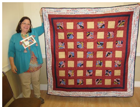
For Quilts of Valor