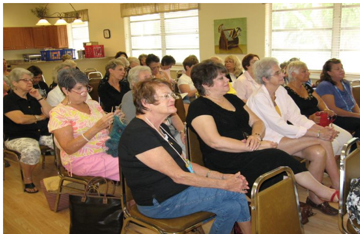
Everyone is watching show and tell.