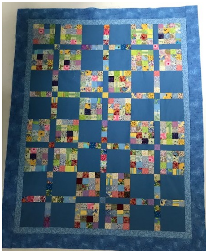
Four small quilts—Sherry Ramstrom