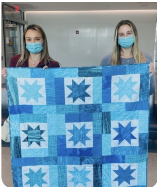
For a trauma patient

Thank you From the bottom of our hearts to this precious Guild that does such beautiful work and already making a difference today 💕💕