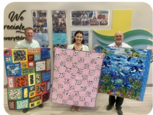
CEO, COO & Admin Director Behavioral Health