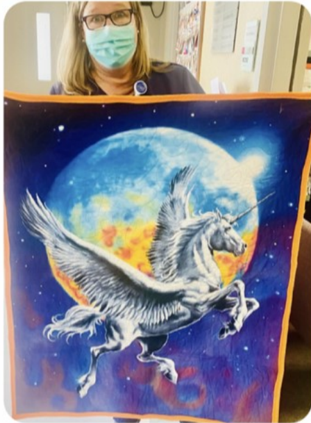
Trauma Clinical Manager