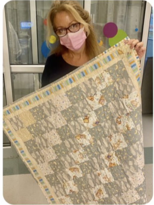
Trauma RN for pediatric patient